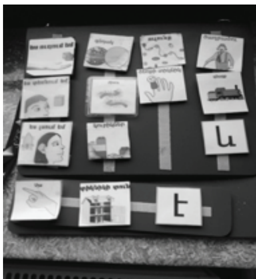
Figure 1 Communication Book (Pictures with Titles in Armenian) with the Sentence Strip.

Since immigrant children typically already have functional vocabulary, and they usually do not display speech disorders, language intervention typically begins at the 4th phase of PECS. It is directed to maximum vocabulary enrichment, correct sentence formation, and gradually extending the use of various parts of speech. After the 4th phase, the 5th phase is perceived quickly and without difficulties.